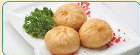
A5 辣子蟹肉包(炸) Chili Crab Crispy Bun (Fried) RM 18.80 3粒/Pcs