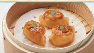
A2 辣子蟹肉虾饺 Chili Crab Dumpling RM 18.80 3粒/Pcs